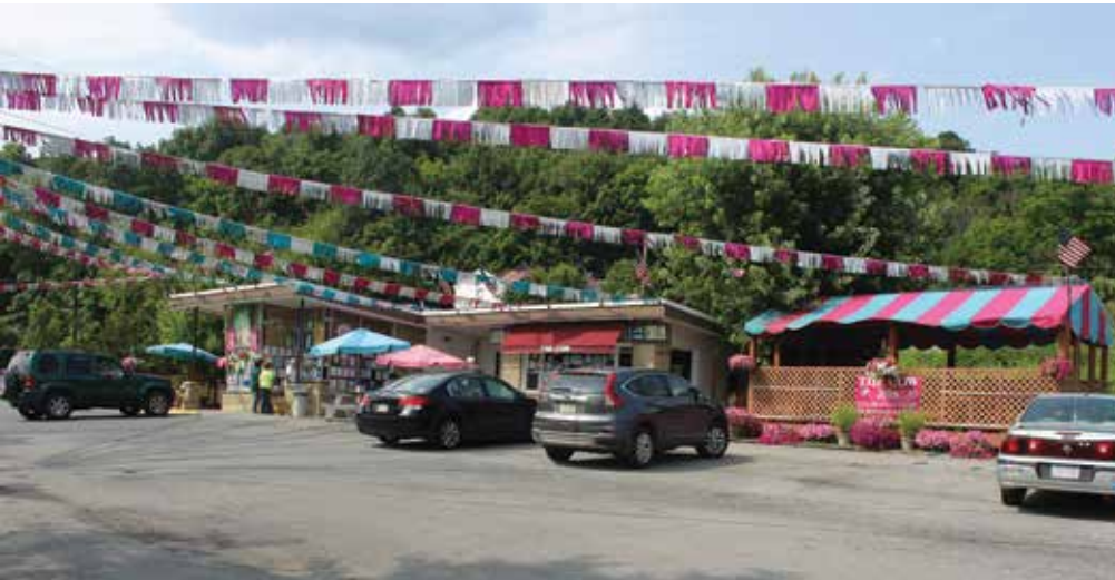
CELEBRATION: Customers are frequent on Ice Cream Day, which was July 15 this year.

The Cow's mix was originally purchased from Johnstown Sanitary Dairy and has always been known for its smooth texture. There are four flavors daily — vanilla, chocolate, orange pineapple and one other that varies from week to week.