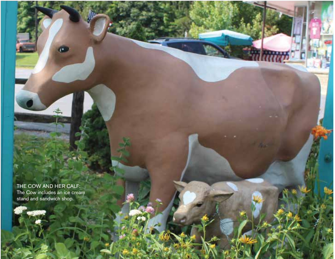
THE COW AND HER CALF: The Cow includes an ice cream stand and sandwich shop.