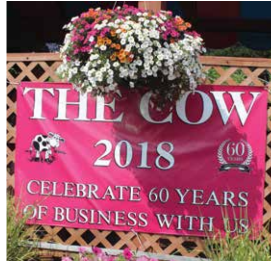
BANNER YEAR: Sign celebrates 60 years of The Cow.